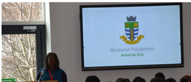
Abena Oppong-Asare Labour MP for Erith & Thamesmead speaking to Year 7s

To have access to professional help if necessary.