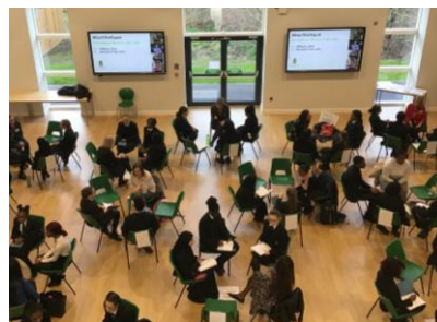
A range of female role models from builders to business entrepreneurs to actresses speaking to Year 8s